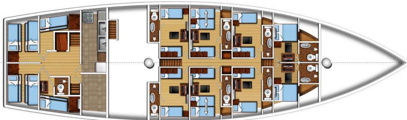
Lower Accommodation Deck